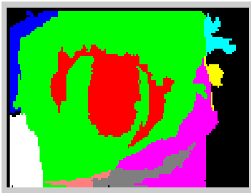
Figure 5(d): This is Final image which shows the objects in different color.