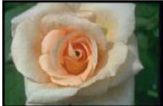
Figure 5(a): This is Original Image on which we applied the object recognition techniques.