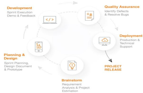
Figure 1: Agile Methodology

We are using highly mature software development cycles to provide the users high-quality output on time. It offers tremendous opportunities, light weight development process, and value to build application in short cycles with quality check in every state.