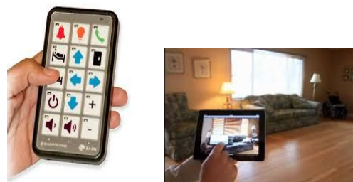
Fig 2: Access Control Devices

Access and control devices as shown in fig 2 allow increased control of the environment or open up access to things in the environment. Some of these electronic controls are switches, special keyboards or mice, and remote controls as well as things that help people get around the community, like ramps, automatic door openers, and Braille signs [11].