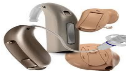
Fig 4: Hearing Aids

There are supports that help a student who is either deaf or has a hearing loss. There include hearing aids, amplifiers, captions on TV, and typing telephones [11] as shown in Fig 4.