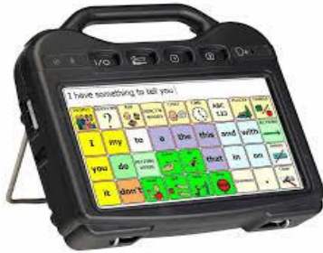
Fig 5: Communication aids

computers, communication cards with texts, communication board with letters, symbols or pictures and electronic communication device with recorded or synthetic speech [11] as shown in Fig 5.