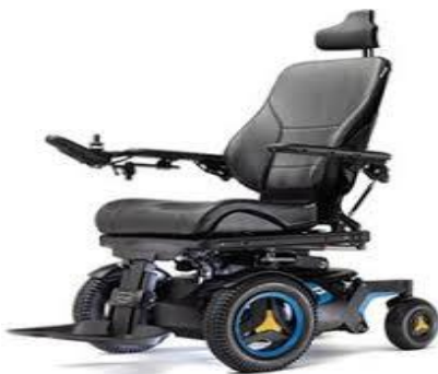
Fig 7: Assistive Wheel chair

Mobility aids as shown in Fig 7 are equipments that allow a student with a physical or visual disability to move independently and safely through the community. Such aids wheelchairs, walkers, and adapted bicycles, Walking stick, crutch, walking frame, manual and powered wheelchair, tricycle Artificial leg or hand, leg or hand splint, clubfoot brace Corner chair, supportive seat, standing frame Adapted cutlery and cooking utensils, dressing stick, shower seat, toilet seat, toilet frame, feeding robot[11].