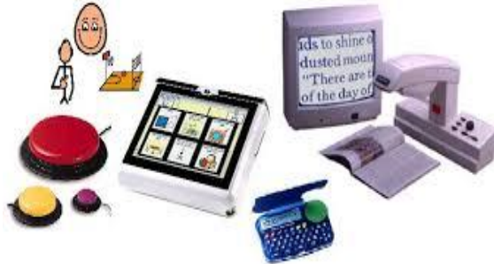
Fig 6: CBI devices

Instruction aids are software to help students with learning difficulties in reading, writing, math and other subject areas [11] as shown in Fig 6.