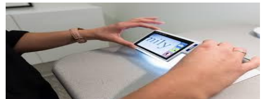
Fig 9: Assistive Magnifier

Visual aids are supports that give a student with visual difficulties access to information. These include large-print books, books on tape, magnifiers, talking computer software, and Braille, Eyeglasses, magnifier, magnifying software for computer White cane, GPS-based navigation device Braille systems for reading and writing, screen reader for computer, talking book player, audio recorder and player Braille chess and balls that emit sound [11] as shown in Fig 9.