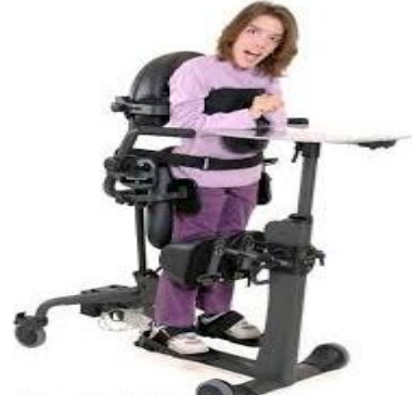
Fig 8: Assistive Standers

Positioning aids as shown in Fig 8 help a student with a physical disability remains in a good position for learning without becoming tired. Some of them are adjustable chairs, tables, standers, wedges and straps [11].