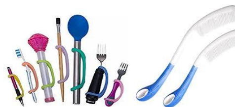
Fig 3: Living Aids

There are special tools as shown in Fig 3 for daily activities, like brushing teeth, dressing or eating. There include adapted utensils, plates and cups, non-skid surfaces, and specially designed toilet seats and shower stalls [11].