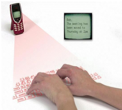
Fig 1: Canasta Virtual Keyboard

The technology is improving so fast that even the borders between these new technologies are fading away and they are getting mixed together. Few examples of these devices are: GPS navigation systems, military super-soldier enhancing devices (e.g. thermal vision, tracking other soldier movements using GPS, and environmental scanning), radio frequency identification (RFID) products, personal digital assistants (PDA), and virtual tour for real estate business. Some of these new devices upgraded and integrated previous methods of interaction. As an illustration in case, there is the solution to keyboarding like Canasta keyboard as shown in figure 1. This is a virtual keyboard that is made by projecting a QWERTY like pattern on a solid surface using a red light. Then device tries to track user's finger movement while typing on the surface with a motion sensor and send the keystrokes back to the device.