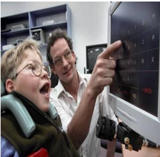
Figure 4: Gaze detection pointing system for people with disabilities

One sensible application of multimodal systems is to deal with and assist disabled individuals (as persons with hands disabilities), which require other forms of interfaces than standard individuals. In such systems, disabled users will perform work on the laptop by interacting with the machine exploitation voice and head movements. Figure four is AN actual example of such a system.