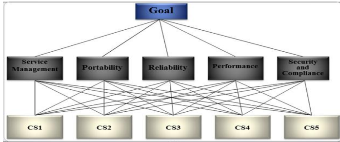
Figure2. Hierarchy of selecting cloud services