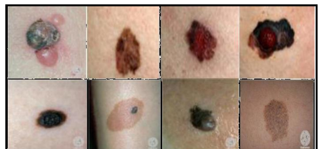
Figure 2.1 Melanoma and non-melanoma skin cancer [4]

The largest organ in the body is said to be the skin. It offers defence against heat, infection, and harm. Additionally, it produces vitamin D and is utilized to store fat and water. It primarily consists of three layers: the Epidermis, the dermis, and the hypodermis (Innermost layer). Melanomas are specific tumors that develop from melanocytes, the skin cells that produce color. Although it generally looks brown or black, it could be blue, red, a mix of hues, or even have no color at all. Although it can develop anywhere on the body, it primarily affects the necks, faces, and legs of men and women as well as the trunks of both sexes. Though less frequent than non-melanoma skin cancer, it nevertheless causes less harm. Melanoma cancer spreads slowly and is mainly detectable in its early stages.