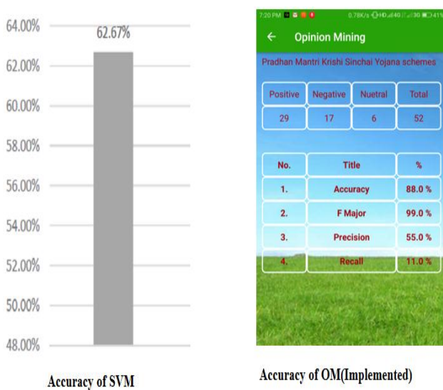
Figure 3 : Result Comparison of SVM and OM (Implemented) Algorithm.

In a given below figure we explain result analysis of SVM(Support Vector Machine) algorithm and our implemented OM algorithm which is clearly shows that accuracy of our mobile computing algorithms is better than existing algorithm. in a figure it is show that Support Vector Machine gives us 62.67% accuracy while mobile computing OM algorithms gives us 88% accuracy.