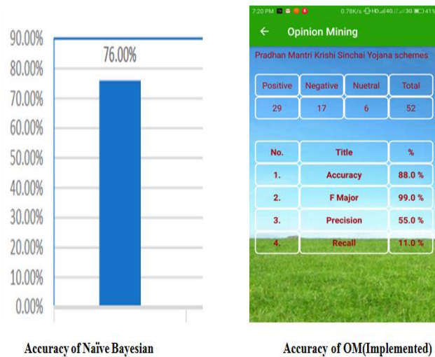
Figure 2: Result Comparison of Naïve Bayesian OM (Implemented) algorithm.

naive Bayesian gives us 76.00% accuracy while mobile computing OM algorithms gives us 88% accuracy.