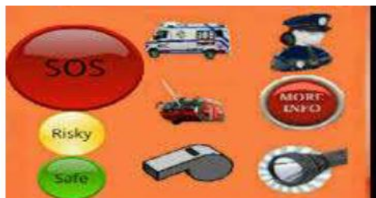
Bisociation with IOT and Smart watches and sos applications with novelty and utility factors

The security in the framework can be further improves by utilizing Geo-Fencing programming that uses the GPS and Google Earth to characterize the Area-Zone for a vehicle that go about as a virtual obstruction. An administrator utilizes the apparatuses gave by the product to define land limits which help to distinguish wherever a vehicle enters or leaves the tweaked geo-fenced zone and confine the drivers to movement from the delicate zones. The administrator can see the reports of vehicle position, speed, start status and voyaging report and furthermore teach the driver on the speaker telephone that is set inside the vehicle[11].