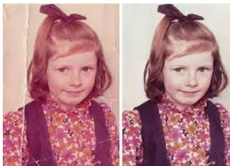
Figure 2: Image Restoration (reference) https://www.stephenpaulphotography.co.uk/imagerestoration

(ii) In recurrence area, the sifting activity is finished by mapping the spatial space into the recurrence area by taking Fourier transform of the image function.