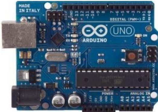
Fig -2: ARDUINO UNO BOARD