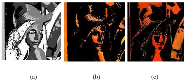
Figure 4: a) Cluster Index Image of Lena using proposed Wavelet KM algorithm b) Segmented Image object in Cluster 1 showing various color regions ( L^*a^*b^* based) of Lena using proposed Wavelet KM algorithm and c) Segmented Image Object in Cluster 2 showing shapes of Lena based on L^*a^*b^* color space using proposed Wavelet KM algorithm.