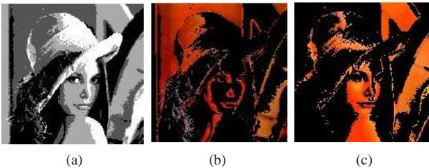
Figure 3: a) Cluster Index Image of Lena using FCM algorithm b) Segmented Image object in Cluster 1 showing various color regions ( L^*a^*b^* based) of Lena using FCM algorithm and c) Segmented Image Object in Cluster 2 showing shapes of Lena based on L^*a^*b^* color space using FCM algorithm.