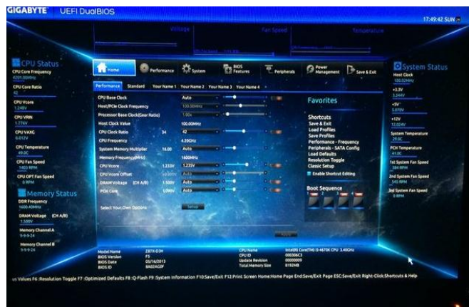
Fig 1.3 Over-Clocking in Intel-i5 4760