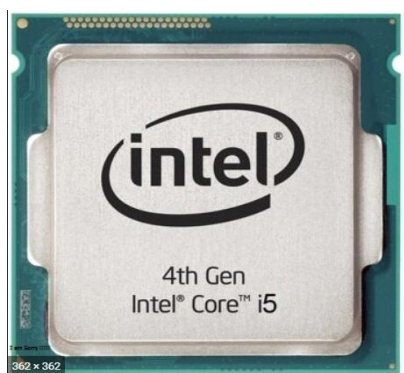
Fig 1.1 Intel core i5 4 th (gen) processor