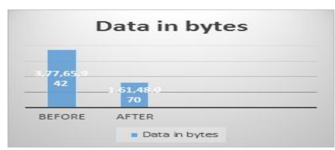
Figure 3 Result of Data Cleaning algorithm

We collected the data from sever in log file format. After collection data firstly we extracted the each field from the data set and apply data cleaning algorithm for remove noise or irrelevant data from log files. Cleaning is the important phase of data pre-processing and take 75% of the total mining process. The method is implemented in Java. For field separation regular expression is used. In Algorithm 1 data field extraction from log files, data size is 37765942 bytes and number of records are 142568. Algorithm 2 reduced the data size from 36 MB to 15.4 MB. We analysis status code (200) for successful requests is 84.25%, status code (400) is 19.05%, above 500 request is 4.5%. Highest number of requests containing GET (99.84%) method.