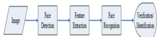
Fig 1: Configuration of a general face recognition structure

approaches inclusive of by shooting a photo of the face within the seen spectrum using a low-cost camera or employing the infrared patterns of facial heat emission. Facial recognition in visible light commonly model key functions from the central part of the facial picture the usage of an extensive collection of cameras in visible mild system extract capabilities from the captured images that don't alternate over the years at the same time as warding off superficial capabilities together with facial expression or hair. In this file, we consciousness on picture-primarily based face popularity. Given a photo taken from a digital digital camera, we'd like to realize if there's any person interior, where his/her face locates at, and who he/she is. Towards this aim, we typically separate the face reputation technique into 3 steps: face detection, characteristic extraction, and face recognition (shown in fig. 1)).