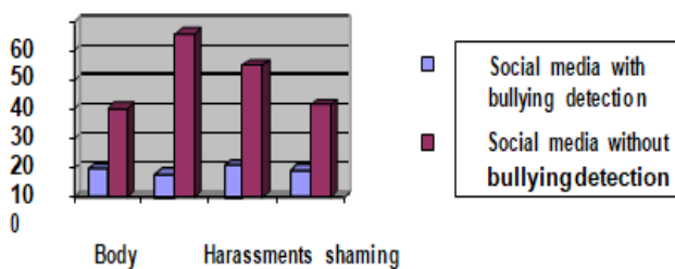
Fig. 2: Comparison of cyber crime rate with and without bullying detection

An ever-increasing number of young people in online networks are presented to and hurt by digital harassing. Studies demonstrate that in Europe around 18% of the kids have been associated with digital harassing, prompting serious sorrows and even suicide endeavors. Digital tormenting is characterized as a forceful, deliberate act did by a gathering or individual, utilizing electronic types of contact more than once or after some time, against a casualty who can't without much of a stretch guard him-or herself.