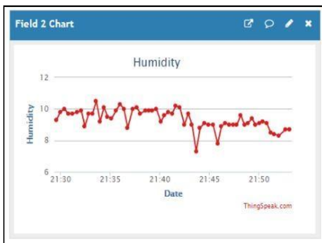
Figure 3 output reading

The web connection point is the association between a client and programming running on a Web server. The UI