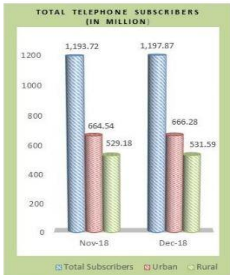
Figure 2 [4]

In India also the number of mobile subscribers increased from 1,193.72 million at the end of Nov-18 to 1,197.87 million at the end of Dec-18. The urban subscription increased from 664.54 million to 666.28 million at the end of year 2018, and rural subscriptions increased from 529.18 million to 531.59 million during the same period. So the monthly growth rates of rural and urban subscription were 0.46% and 0.26% respectively in the end of the year 2018.[4]