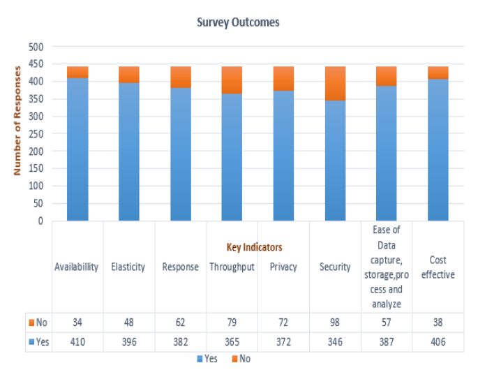
Figure 2. Survey outcomes for Questionnaire

Test Statistic -: Chi-square test is applied with 1 degree of freedom at 5% level of Significance.