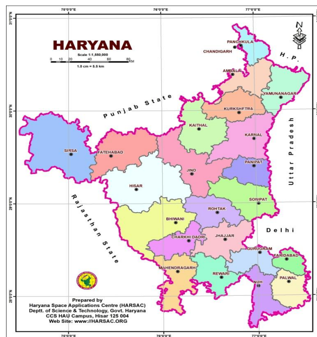
Figure-2, Map of Haryana, indicating districts boundary

The present city of Hisar, one of the essential urban communities of North India, is situated at 29°05'5" north scope and 75°04'55" east longitudes. It is arranged one hundred sixty four kilometres west to Delhi on the National Highway number ten.